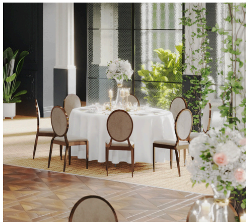
Banquet Seating & Dance Floors